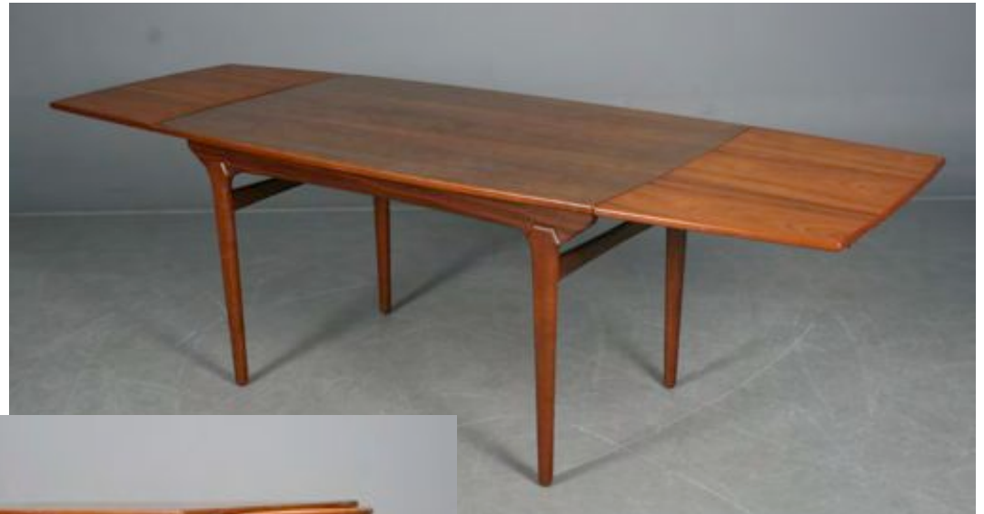
Table and chairs can be sold as a SET or separately*