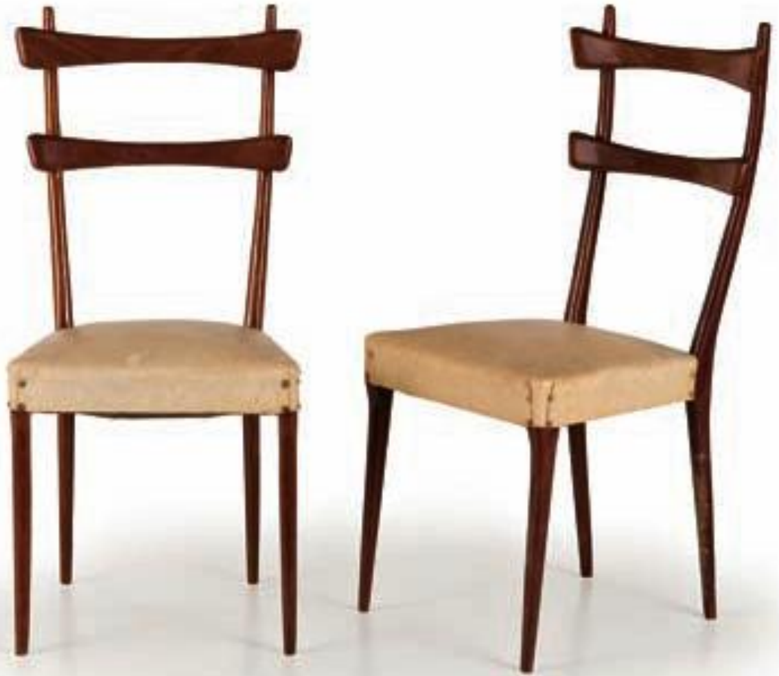
4 Italian chairs. 1950's Rosewood frame and upholstered seat