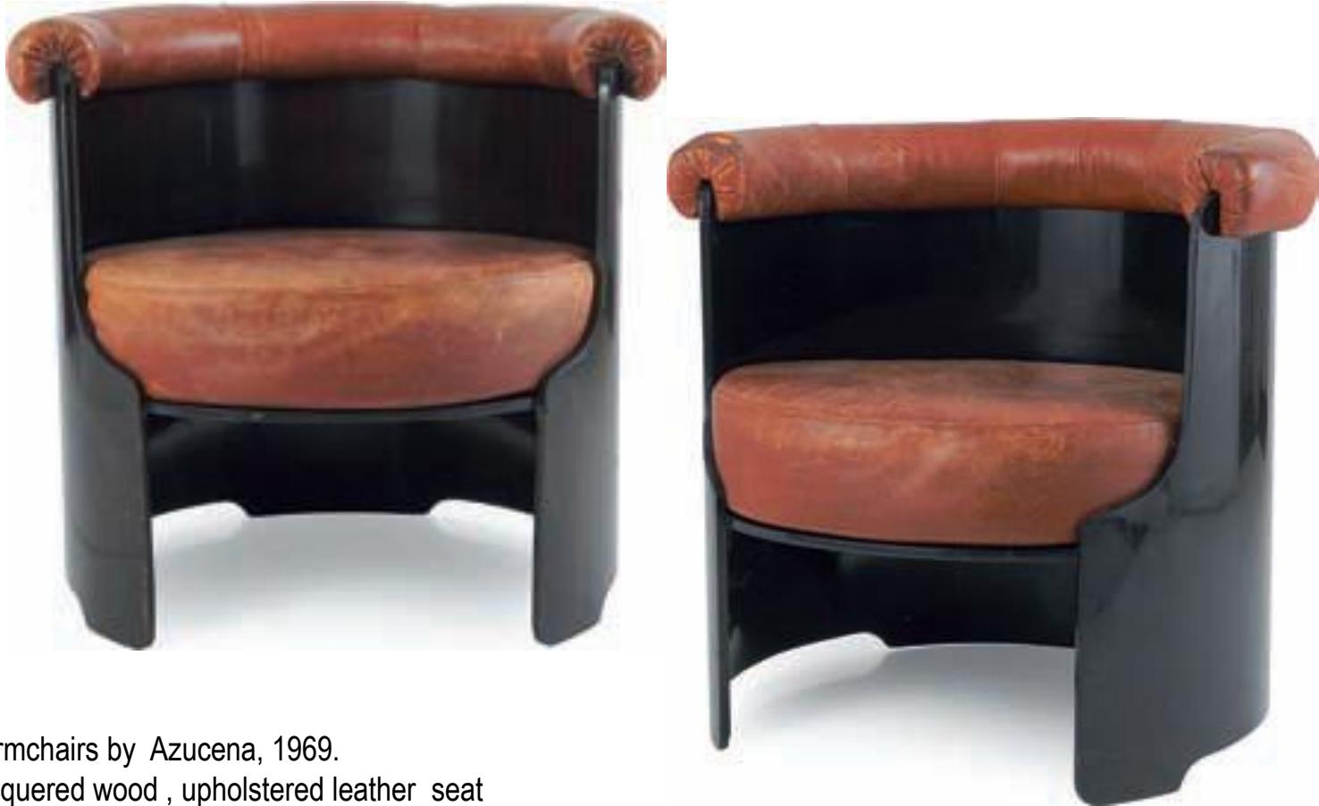
4 armchairs by Azucena, 1969. Lacquered wood , upholstered leather seat And back rest